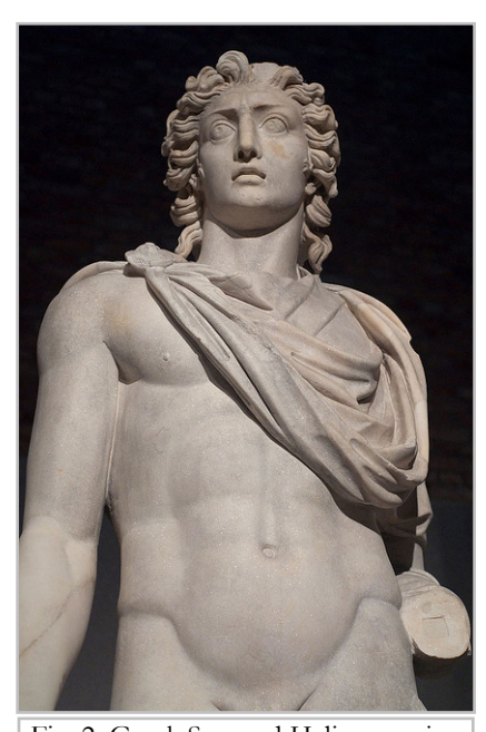
Fig. 2. Greek Sun god Helios wearing only a chlamys, a Greco-Roman mantle, as he does in several Mithraic motifs, and an important identifier of his 'ethnicity'.

In this context, we have found a different Aryan influence in Rome though it is not through Mithra. That discussion is beyond the scope of this article.