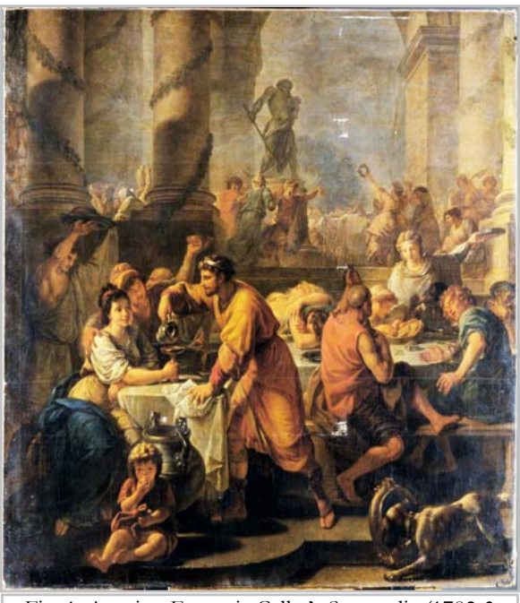
Fig. 1. Antoine-François Callet's Saturnalia (1782-3 CE). The revelries culminated in Natalis Invicti.

The festival of Saturnalia was dedicated to Saturn, god of the harvest. By all accounts,