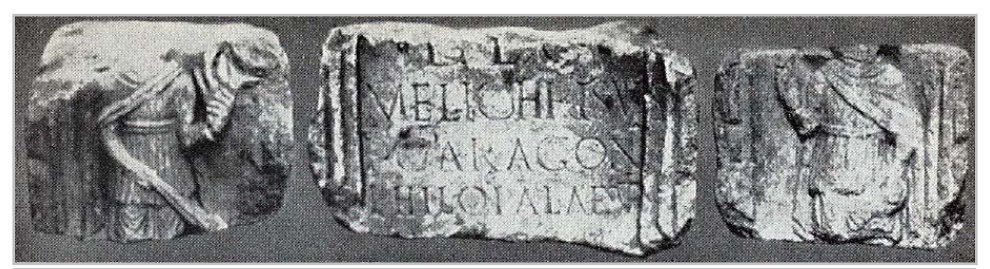
Fig. 3. Mithraic altar fragments found at Novae near Steklen, Bulgaria. Note 'Persian'/Aryan clothing on Cautopates & Cautes (Mithraic associates) on the left and right resp.

and the earliest Mithraic artifacts discovered have been at sites that date to between 80 and 100 CE.