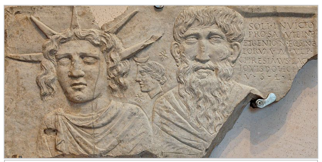
Fig. 5. Dedication slab with Sol the Sun god wearing a chlamys and emanating solar rays. Luna, the Moon goddess is in the background with a crescent resting on her had. The bearded male is likely Jupiter Dolichenus who is invoked with Sol in the inscription beside him. The slab – which does not depict or mention Mithra – was discovered at the barracks of the Equites Singulares, via Tasso, Rome and is dated to between 150 and 200 CE.

Further, as with Roman Mithraism, the motifs depicting Jupiter Dolichenus (see fig. 5) depict the Greco-Roman deities Sol and Luna as well.