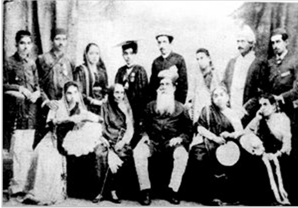
Photograph taken during Bhikhaiji Cama's wedding. Standing second from left is Bhikhaiji's husband Rustamji Cama. Perhaps the woman sitting in front of him is Bhikhaiji.