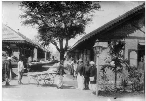
Caring for victims of the plague in Bombay/Mumbai.

Unfortunately, she contracted the plague herself and survived only to be so weakened that in 1902, she had to move to London for medical care.