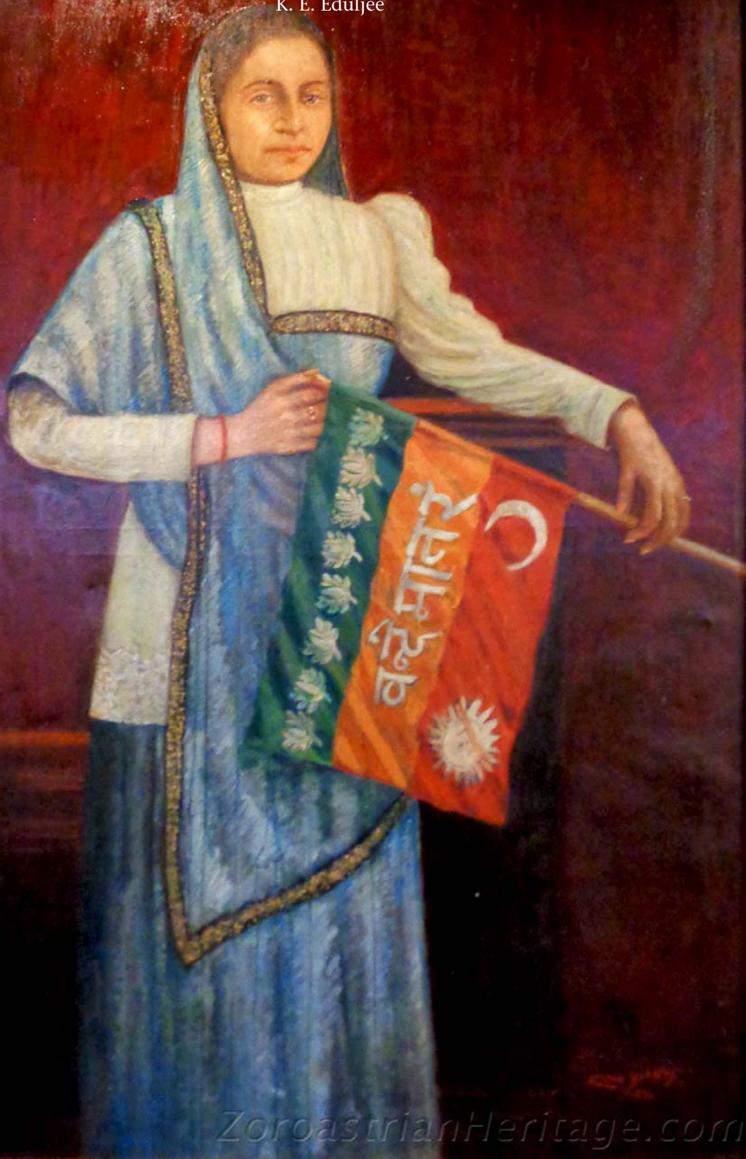
Madame Cama holding her flag of Indian Independence. Painting by Cumi Dallas (1972).