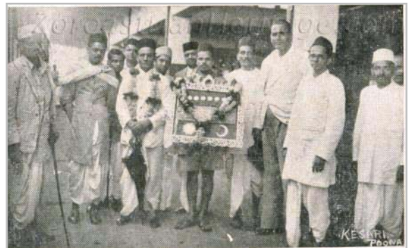
Bhikhaiji Cama's flag being feted at the Kesari-Maratha Library in Pune, India.

While several authors claim that the flag Bhikhaiji unfurled at Stuttgart was based on an earlier design made by others, they provide nothing tangible to substantiate their claims and we have yet to see anything that demonstrates that Bhikhaiji's Stuttgart flag was made by anyone other than herself. 8