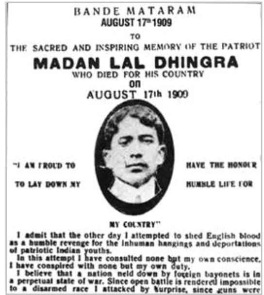
Bande Mataram dedication to Madan Lal Dhingra.